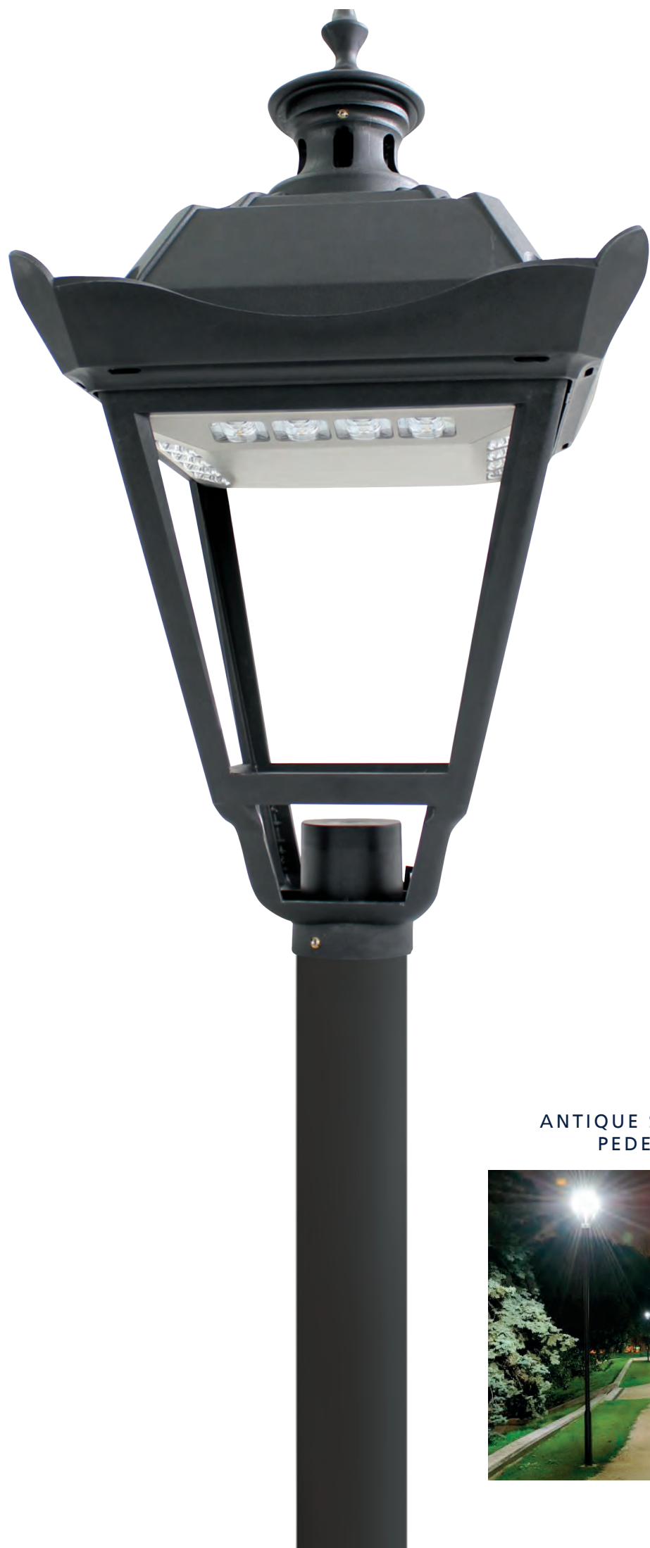
ANTIQUE STYLE LED POST TOP LANTERN FOR PEDESTRIANIZED AREAS OR FOOTPATHS