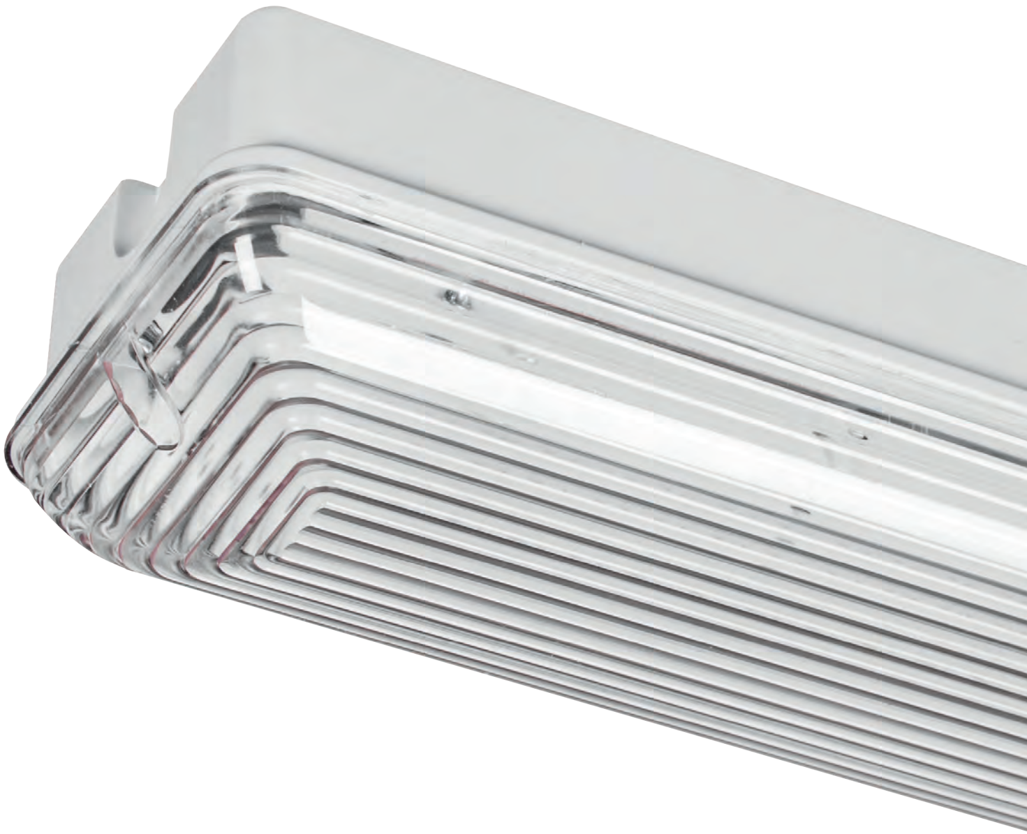
VERSATILE EMERGENCY BULKHEAD