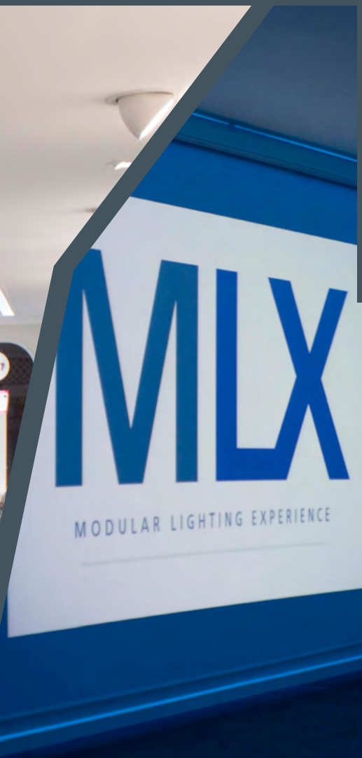
MLX Showroom Redditch

Over £1½ Million invested since 2015 in visitor facilities