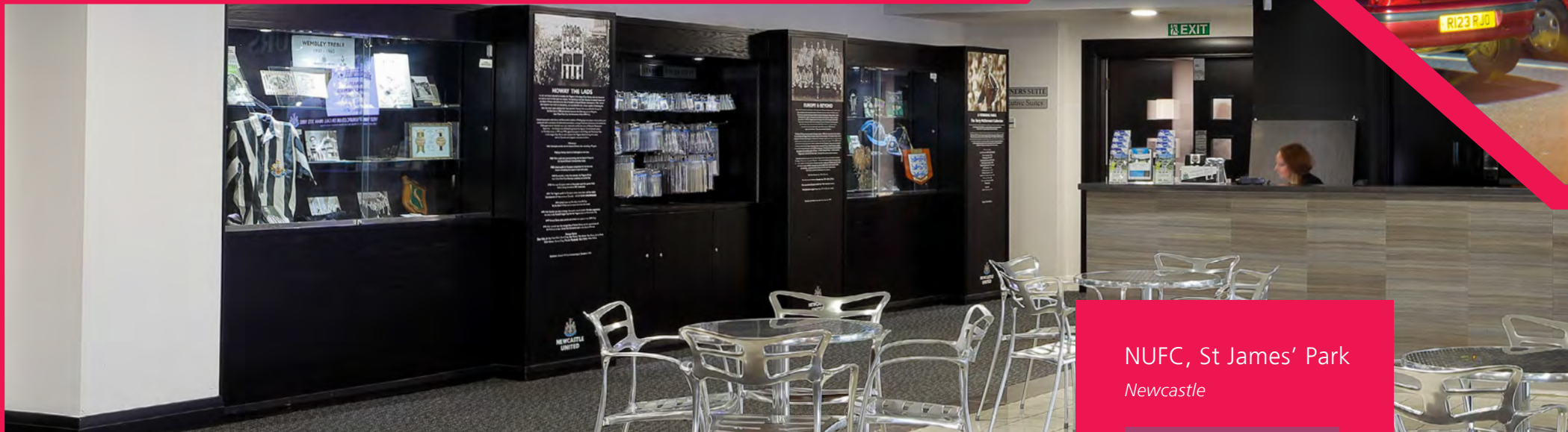
NUFC, St James' Park Newcastle