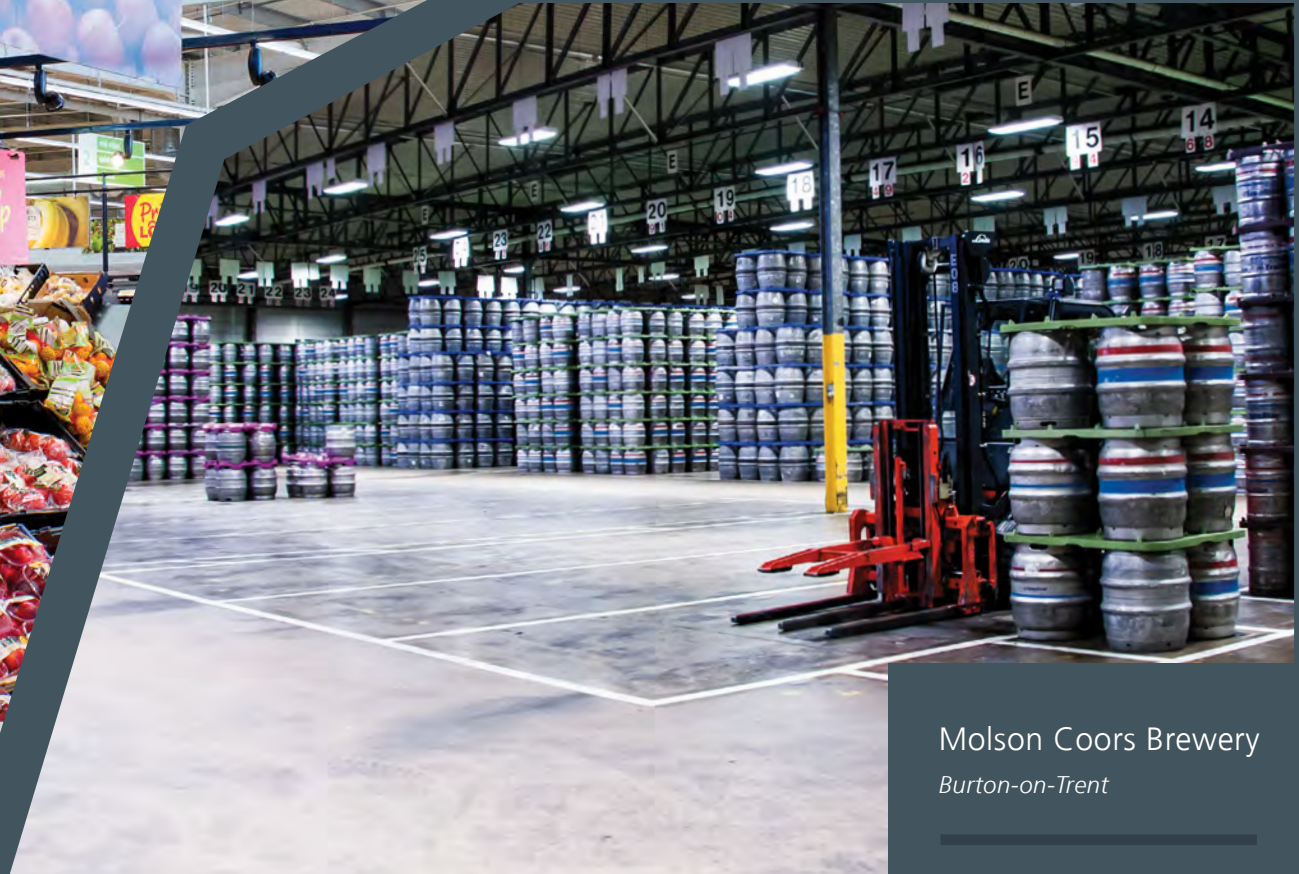
Molson Coors Brewery Burton-on-Trent