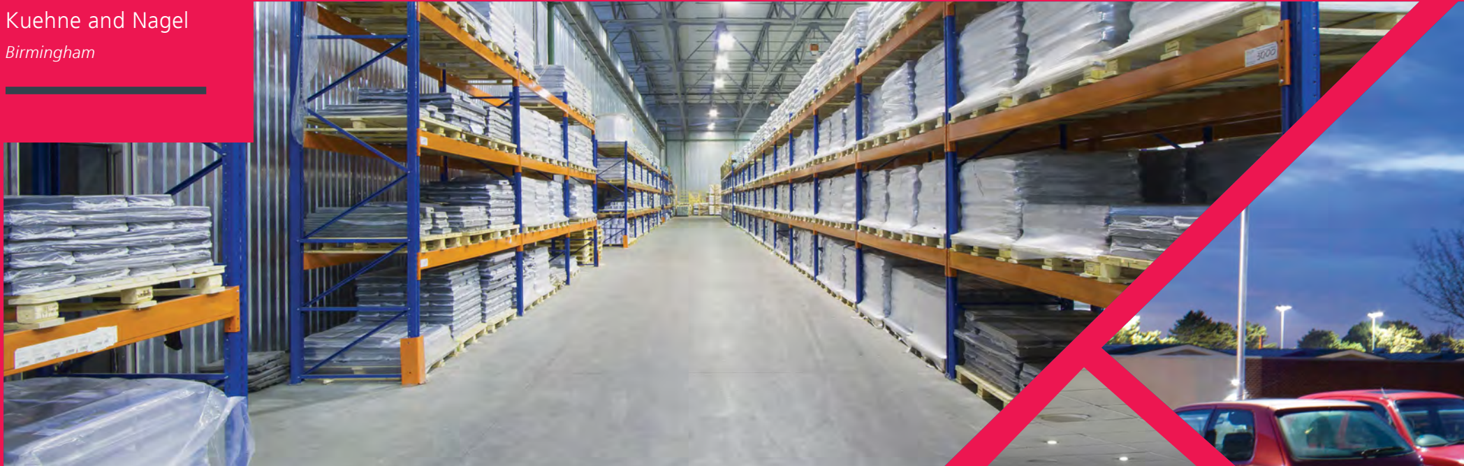
Kuehne and Nagel Birmingham